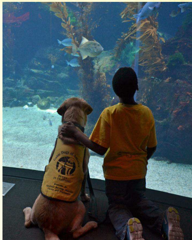
This young man liked me, he put his arm around me and we watched the fish together