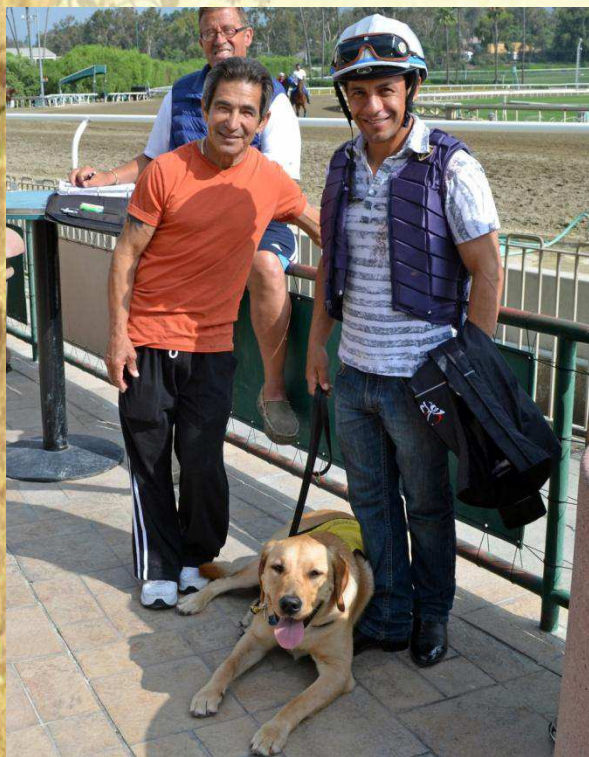
Famous Jockey's Laffit Pincay Jr & Victor Espinoza who rode California Chrome. I met them at Santa Anita Racetrack