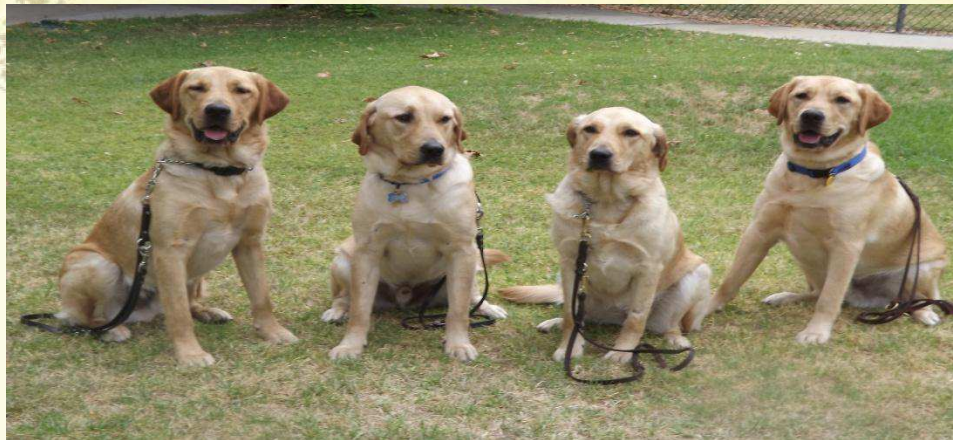
Here are me and my littermates on Turn In Day and one of just me below