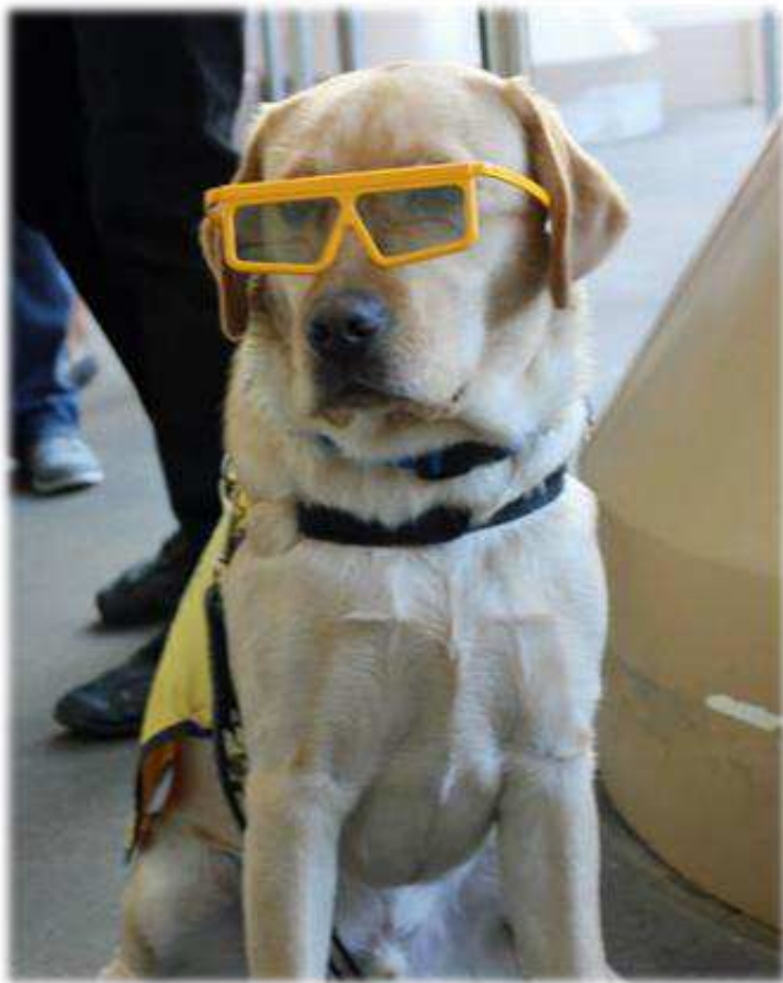
Toy Story Mania here I come.