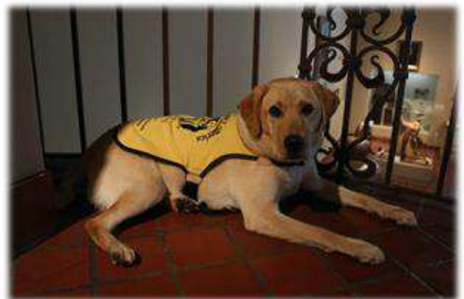
Taking a break overlooking some Western American Heritage.