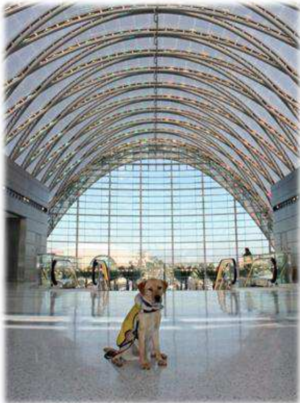
And again from the inside, top floor.