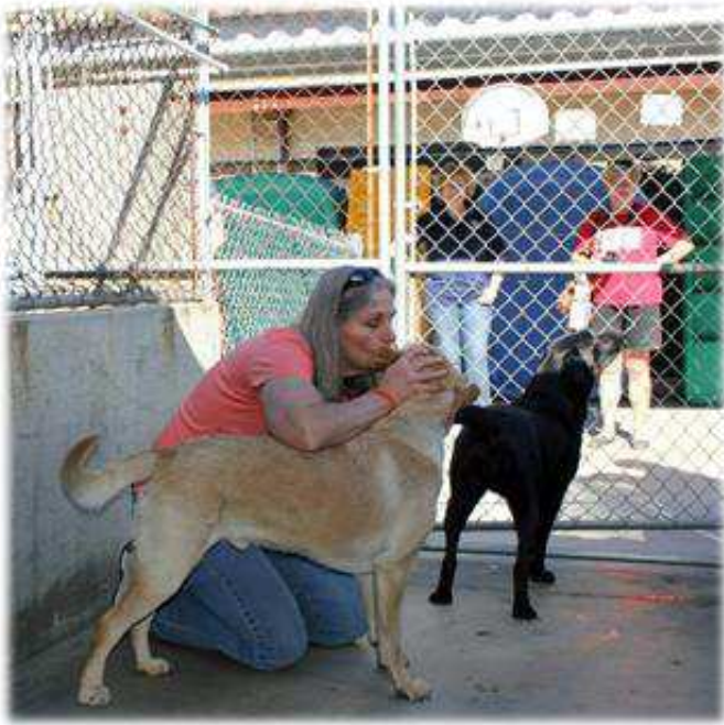
My puppy raiser whispered special words in my ear.