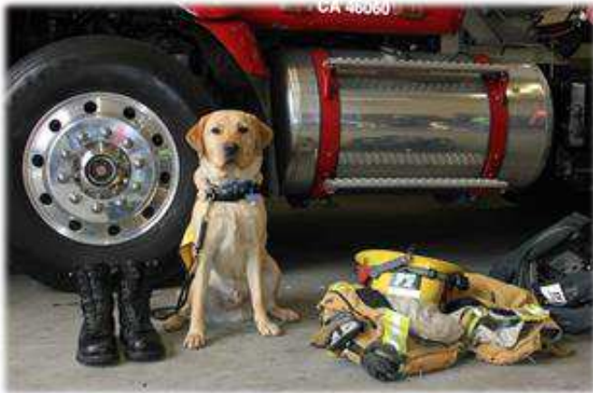
Tagg, ready for duty!