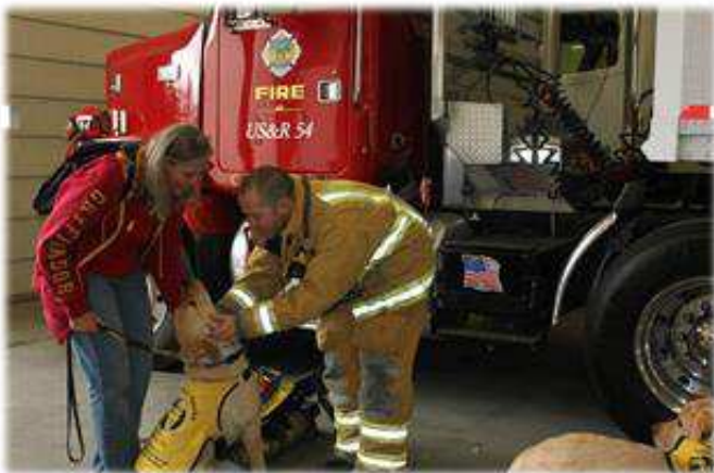
The firemen put their suits on in stages so we would not be overwhelmed with the full gear.