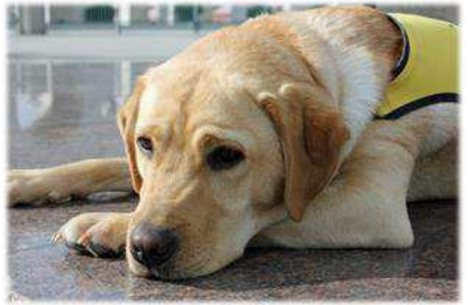
It felt good to rest on the cool marble.