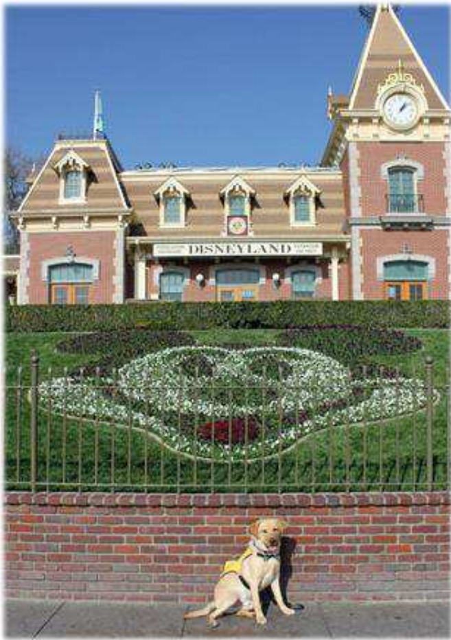
First trip to Disneyland, we opened and closed the parks!