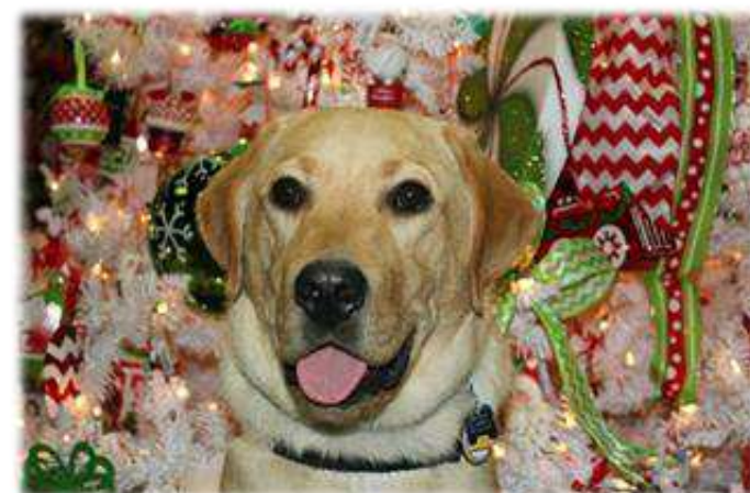
Now the red and green tree.

My puppy raiser likes to Christmas shop at Knott's Berry Farm Marketplace. There were many Christmas displays!