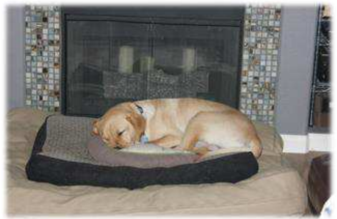
My puppy raiser bought me this little bed when I was just 8 weeks old. I have always loved it and still do.