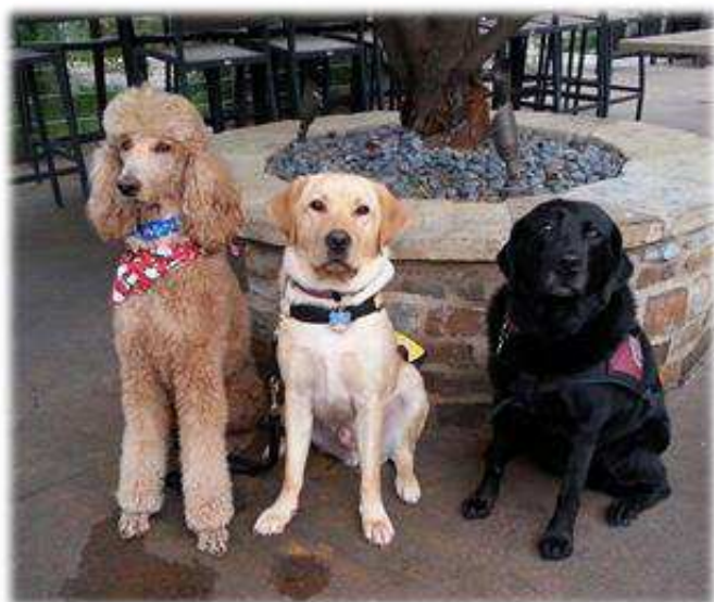
Lunch at the Brea Lazy Dog Café with my friends, Banner, retired service dog and ambassador for Canine Support Teams, and Virtue, Service Dog, Canine Support Teams. I am the one in the middle in case you couldn't tell.