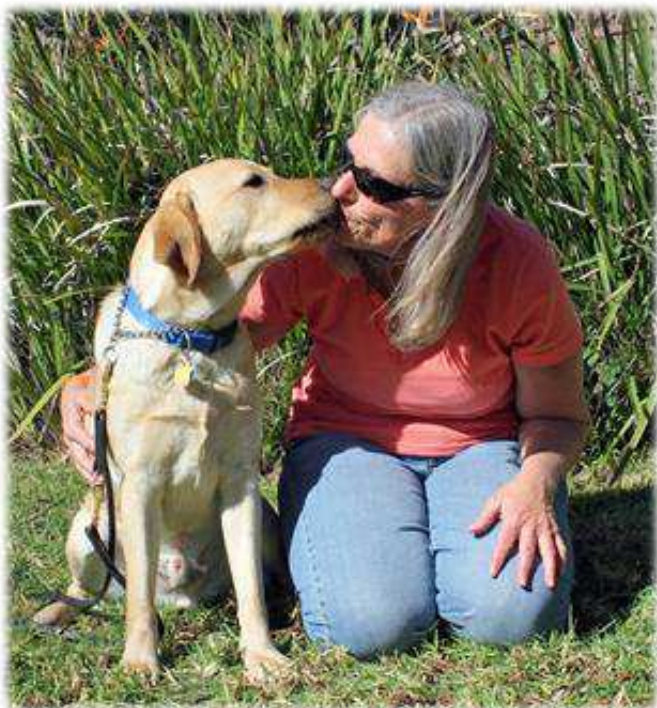
Giving kisses to my puppy raiser to tell her I will be okay and will make her proud.