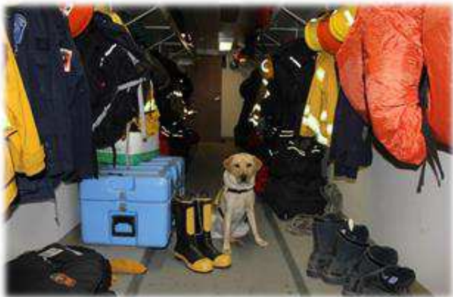
This is the equipment room, a lot to grab in a hurry!