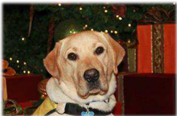
The Grand Californian at Disneyland, Christmas tree.