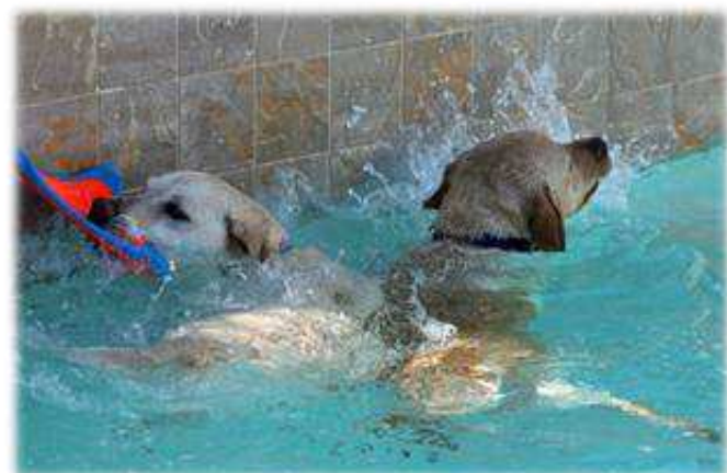
... even when someone else gets it first. ☺