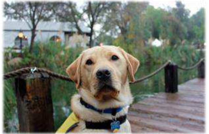
We attended a Canine Support Team graduation where my buddy, Atlas, graduated as a PTSD dog and my buddy, Banner, became an ambassador dog. It was at Monteleone Meadows, a beautiful winery.