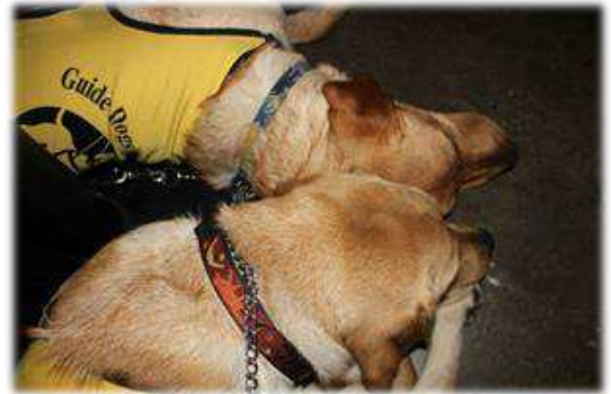
Chilling during lunch at Universal City Walk.