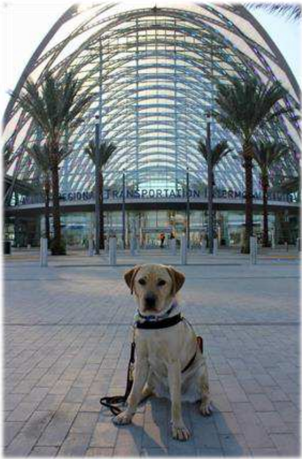
We took a walk from work to visit ARTIC, the new transportation center in Anaheim. This is the view from the outside.