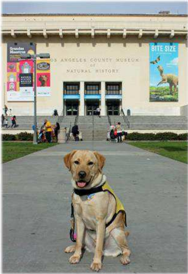
Next we went to the Natural History Museum to practice some more.