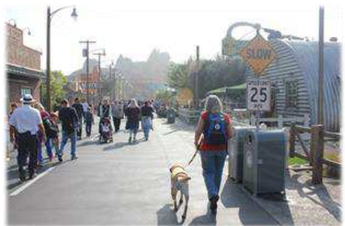
Heading to Radiator Springs in California Adventure. They have special kennels available at the rides so that I stay safe while the humans ride the rides.