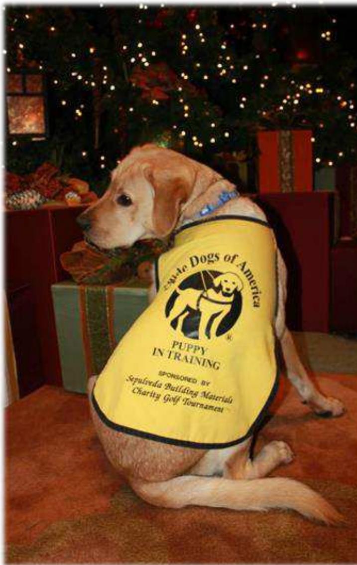
Showing off my sponsor jacket!