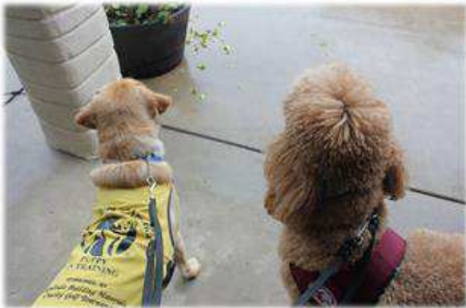
Myself and Banner are marveling an the longhorn steers in the meadow. Large beasts for sure.