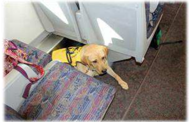
On our way to Universal City Walk on the Metro!