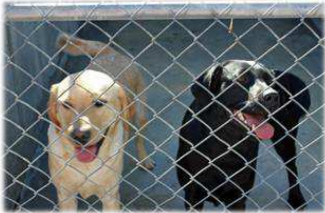
'til we meet again.