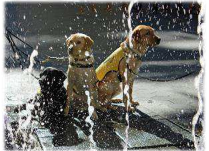
These fountains were no match for me at Universal City walk outside the restaurant. The waters would shoot up then stop then shoot up again. No distraction at all. I just stood there and looked at them with my fellow puppies in training.