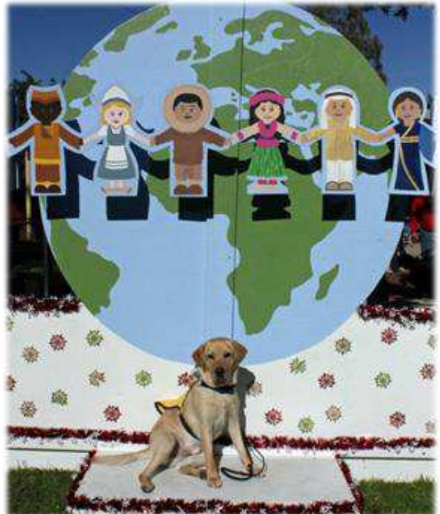
The Sylmar group had a float in the Granada Hills parade and it was at the party for photos.