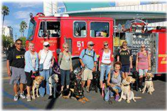
This is the group who went and the local firefighters let us pose with the truck at Universal City Walk.