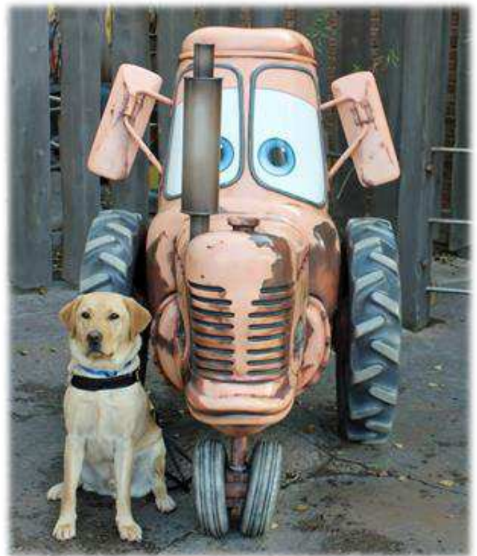
Tractor at Cars Land.