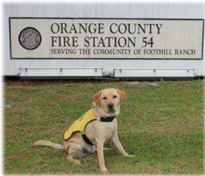
Fire station outing.