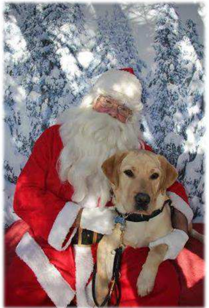
I hope Santa brings me all I want for Christmas! I told him I wanted a large bone, cookies, and squeaky toys.