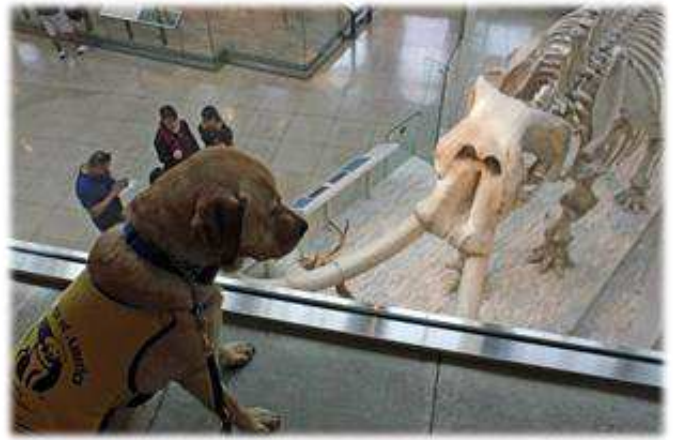
Yikes, that was one big dog!