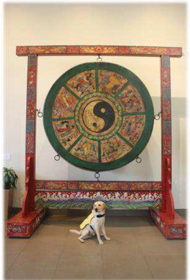
Life is about Ying and Yang and beautiful things.