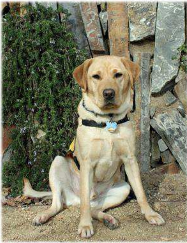
We were watching children play in the grass outside The Grill after lunch.