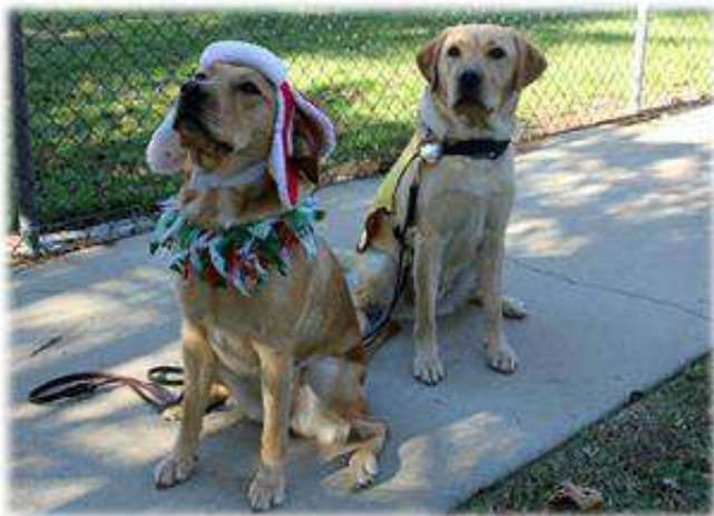
We were in line behind my sister Tippy who was really decked out for the occasion!