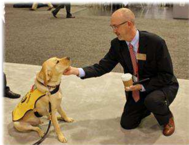
It was important to stay sitting, no one wants yellow dog hair on their black pants!