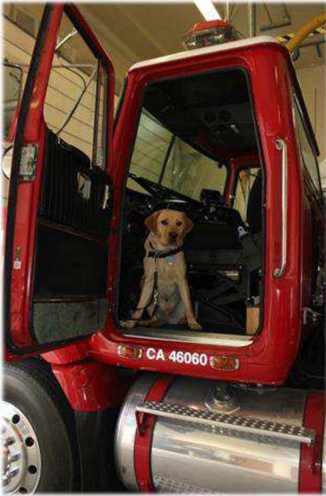
Wow, this fire truck is awesome and I look good in the front seat!