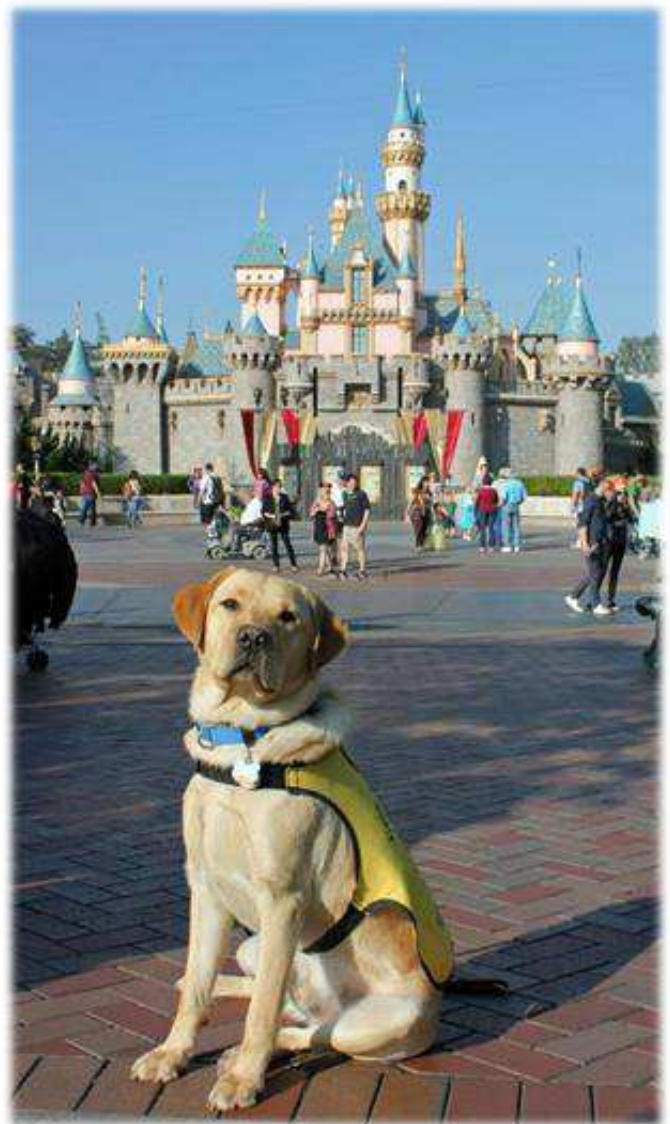
Cinderella's Castle, Spectacular! Disneyland has service dog relieving areas which makes it nice for me and my puppy raiser.