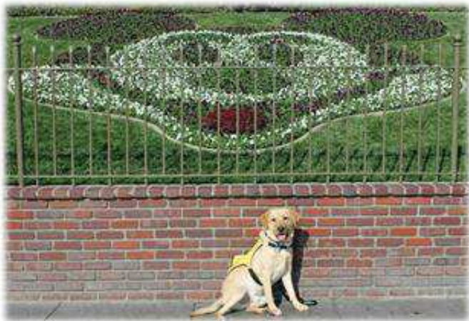
Everyone gets their picture here!