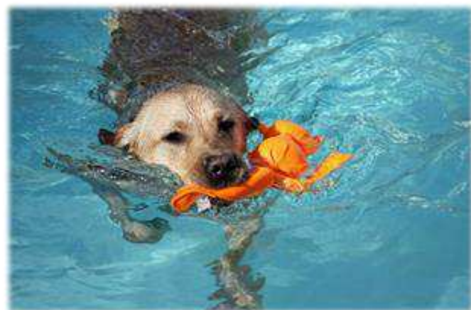
Going to get toys in the pool is fun ...