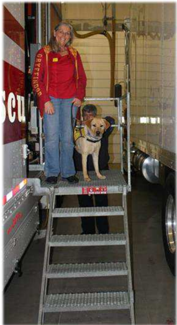
These were open grated stairs with no hand rails. Such good practice!