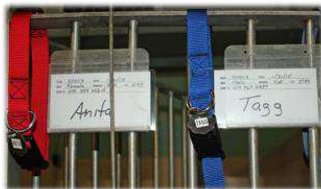
Our name tags and new training collars.