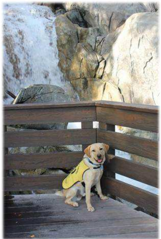
Grizzly River Waterfalls by It's Tough to be a Bug.