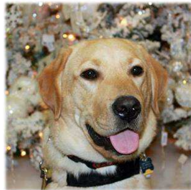
In front of the lovely white Christmas tree at the Knott's Marketplace.