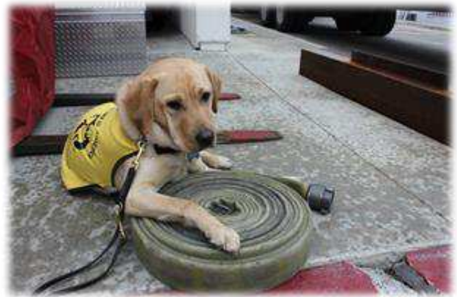
I found a Higbee! Higbee is a new puppy sponsored by Sepulveda Building Materials and he is named after the special notching on the fire hose to indicate where the threading starts.