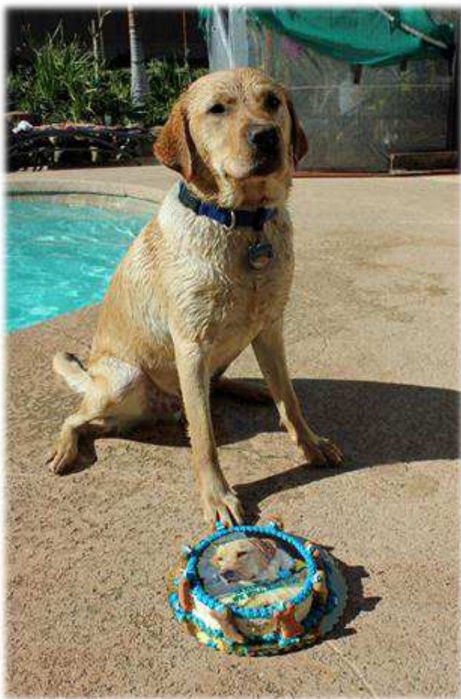
Here I am with the doggie Farewell cake from all my pals.