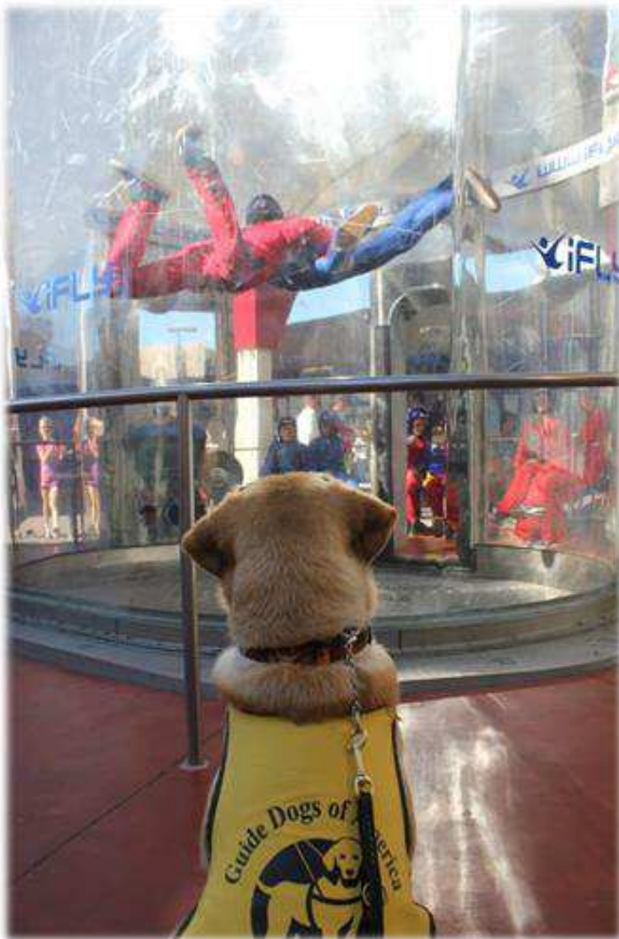
This simulated parachute adventure was fascinating to me. I watched them for fifteen minutes. The teams would float up and down, and up and down went my head. I had a crowd just watching me as I was so interested.