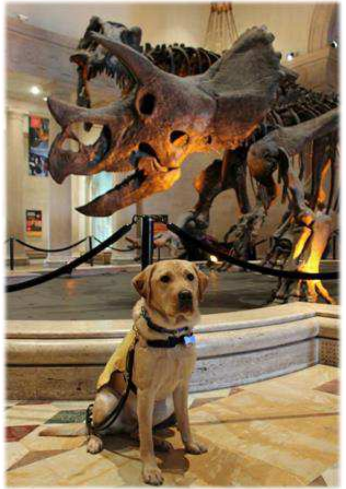
And, this one was an even bigger dog!