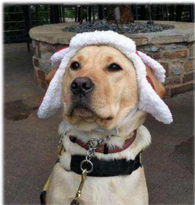
My puppy raiser got the idea that I needed a Christmas aviator hat and was proud that I kept it on!