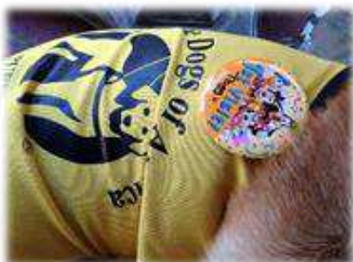
First Time Visitor button to the Magic Kingdom!