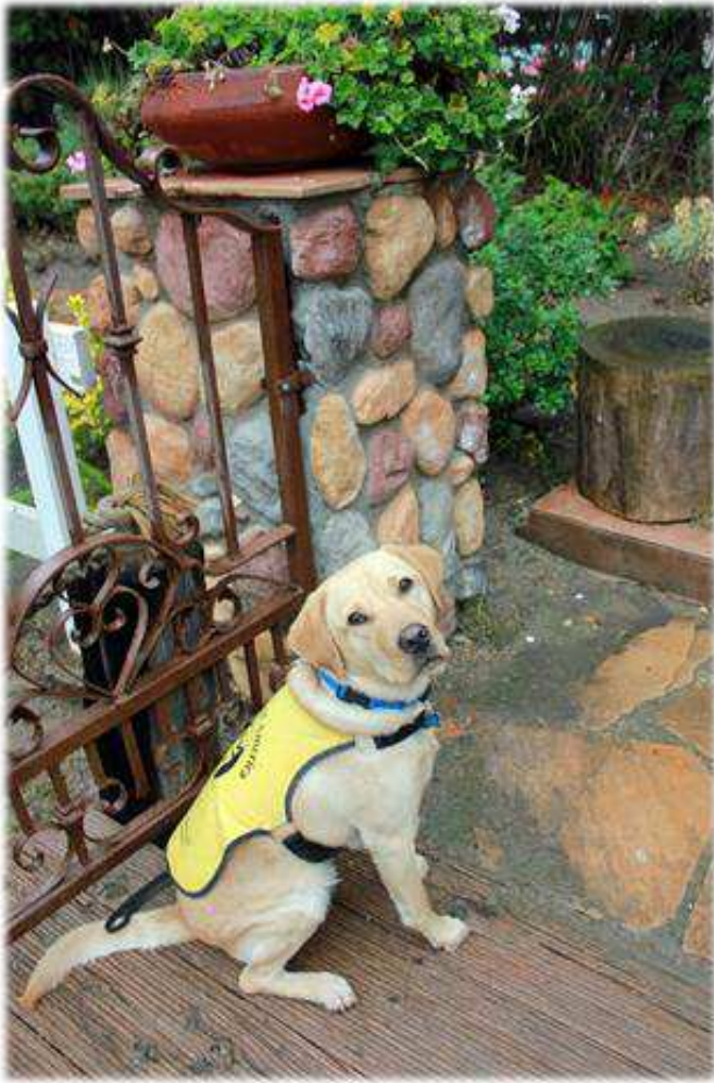
It was a rainy day, but, we got some handsome shots.