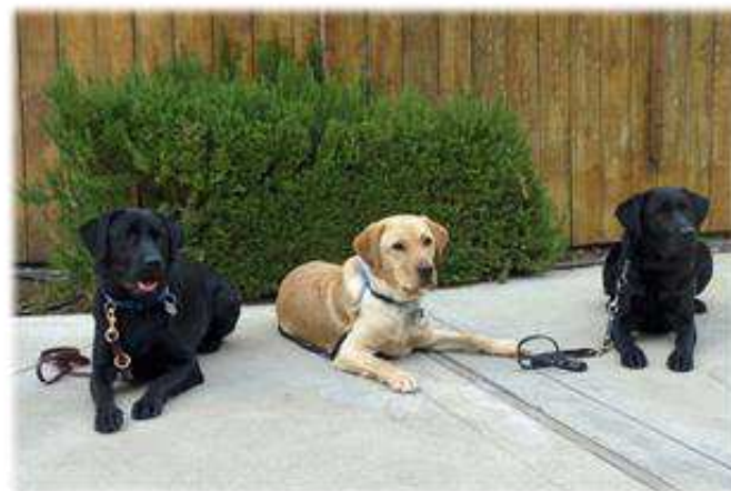
There were 12 of us in the litter so we look forward to re-uniting with our brothers and sisters.

Sitting with the bricks at GDA, many in memory of loved ones human and canine.