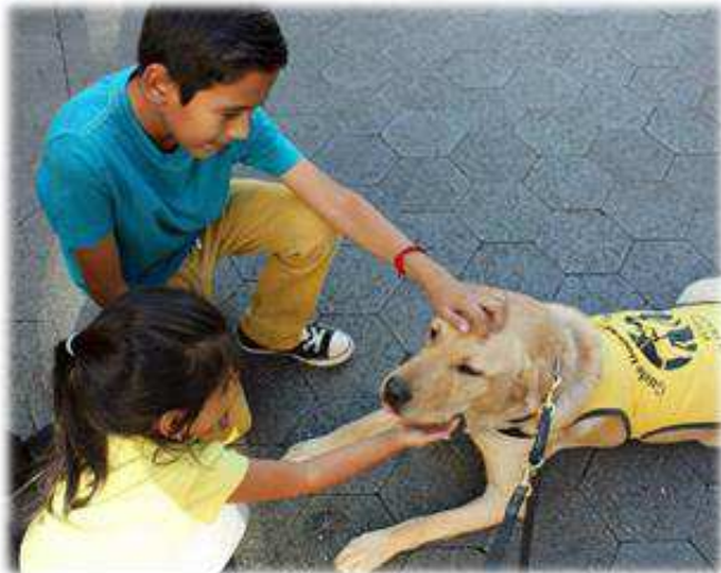
I am also a kid magnet, they all want to pet me.