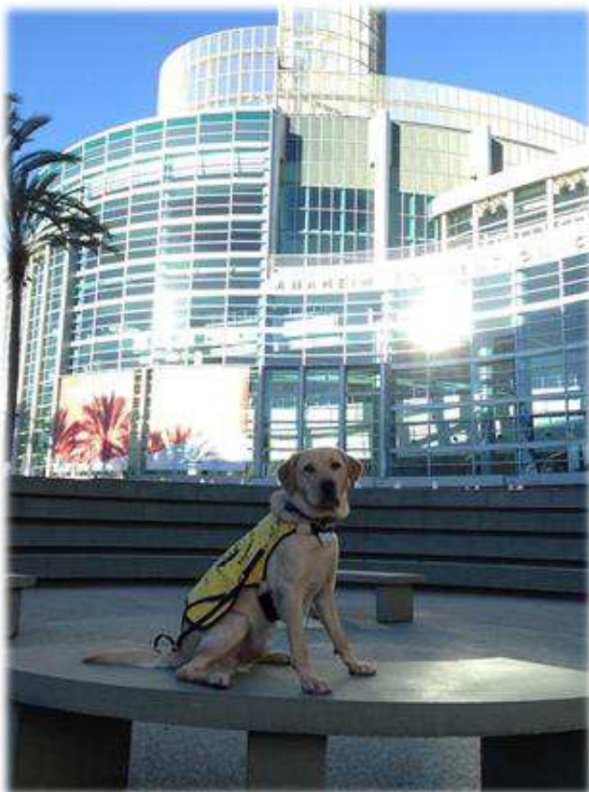
Waiting for thousands of attendees to come to Automation Fair for Rockwell Automation.