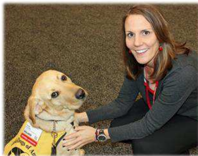
Others greeted me on the show floor. It took us an hour to get anywhere!