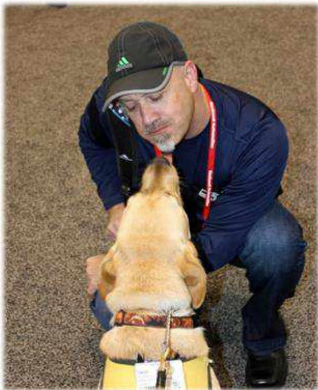
We greeted every attendee on the first day. Some of them wanted to stay with me instead of going to the convention!