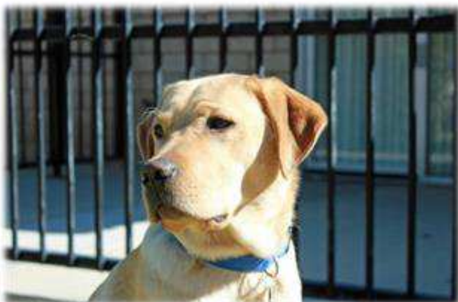
Here I am in front of one of the private dorms I dream to be in when I meet my partner.