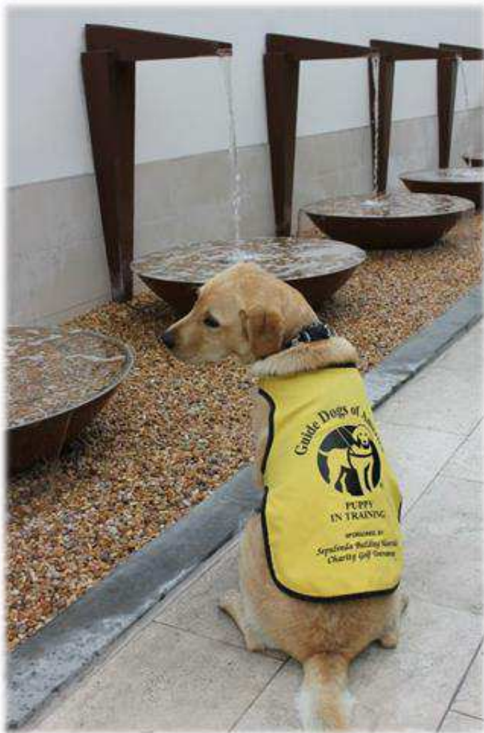
Beautiful and relaxing fountains!