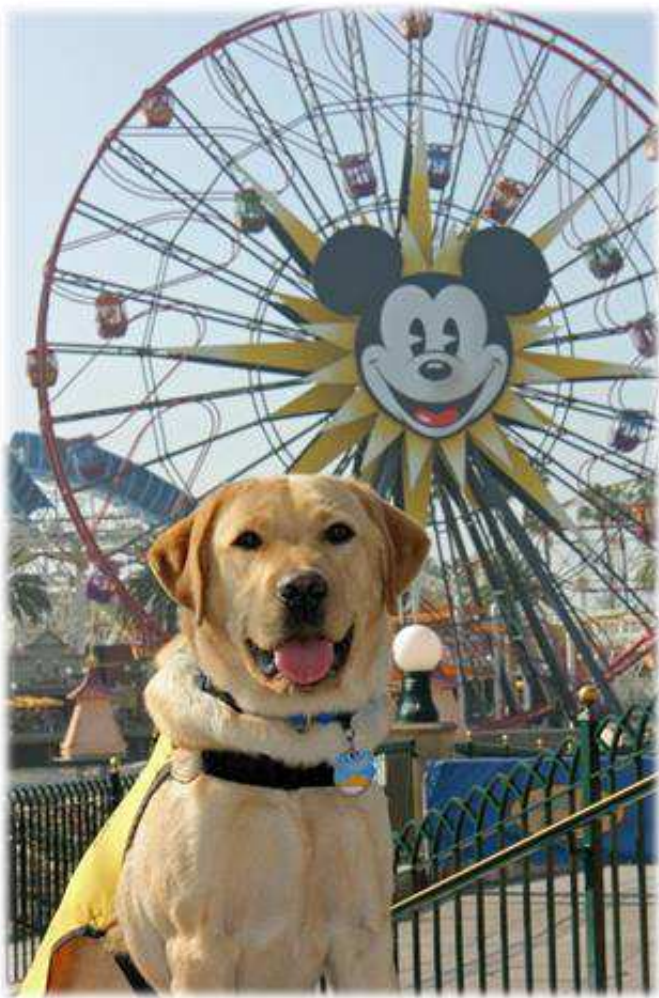
Smiling like Mickey Mouse!