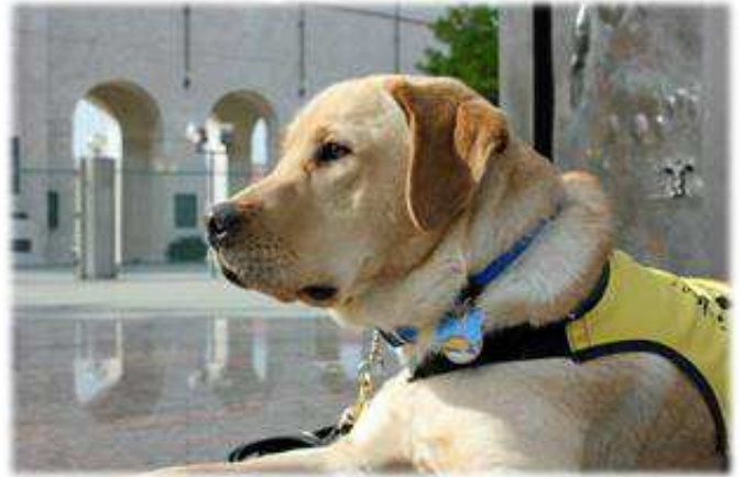
Such a handsome boy I am!