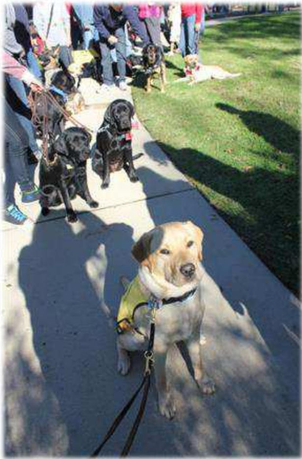
GDA always has a Christmas party for all the puppies and puppy raisers. This is me waiting in line nicely to see Santa.