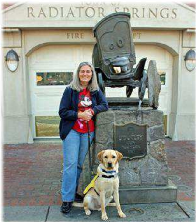
Radiator Springs in Cars Land.