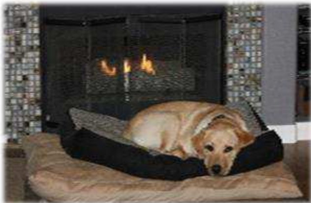
Finally the weather has cooled down and we can enjoy the fireplace!