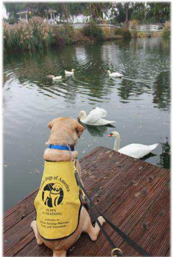
The geese here at Monteleone have a strange attraction to me, a dog.