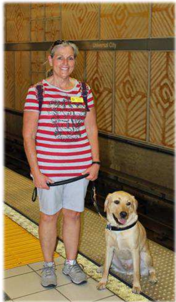
Waiting for the train to take us back home.