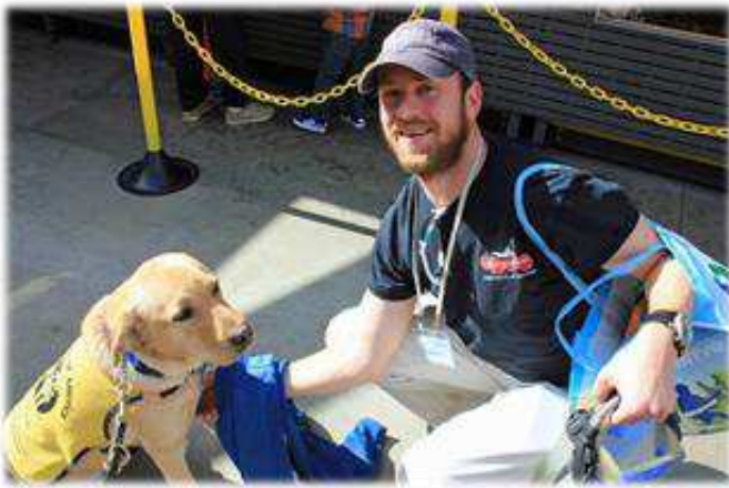
Meeting some of the staff. More calm greetings.