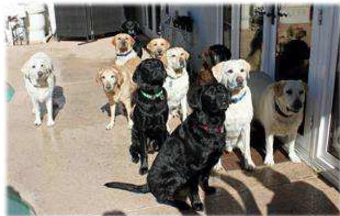
These are all my doggie friends. I am the youngest at 17 months and we are unsure how old the oldest one is. Some are rescues, some are retired service dog breeders, some are retired search dogs, some are nosework champions and some are dock diving champions. I love them all. I am in the back with a blue collar.