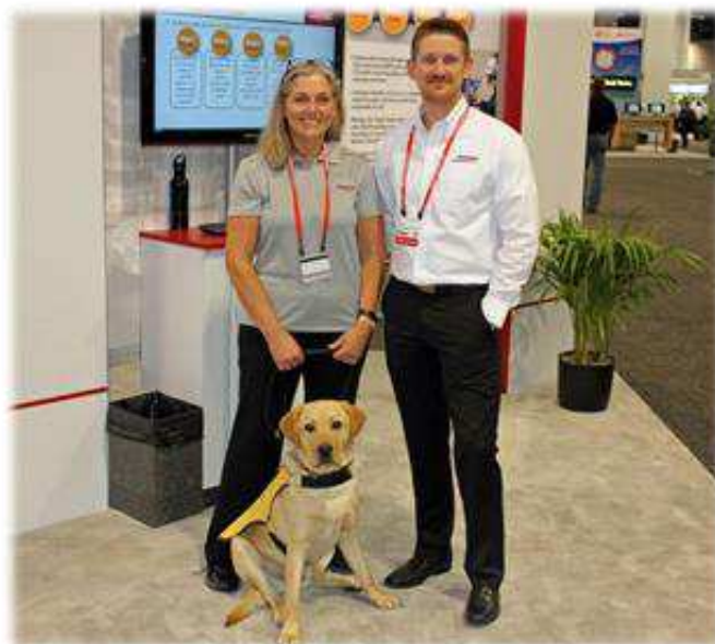
Sometimes I stood in booths to help entice customers in to see the products!