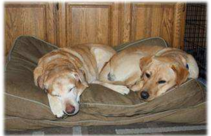
I love my Paisley, she is almost 12 and she tolerates me very well.