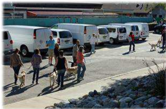
Making the walk to the kennels.