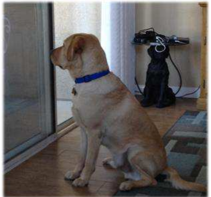
Waiting for the U-Verse guy on New Year's Day