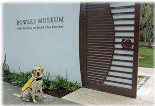
Entrance to the Bowers Museum in Anaheim.