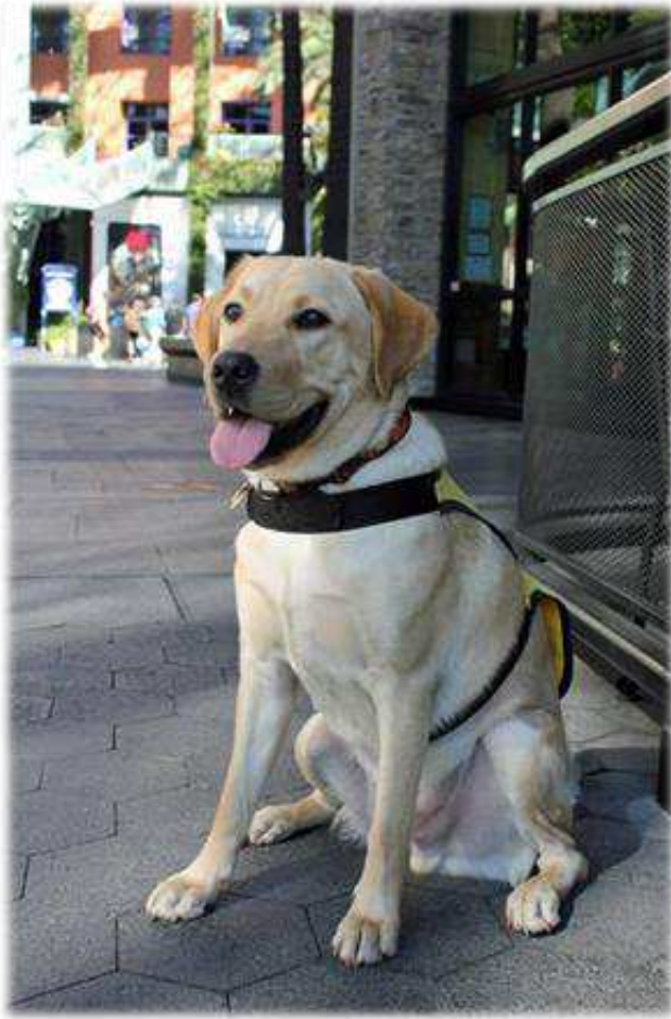
Here I am waiting for the group. My puppy raiser (and many others) think I am so handsome.