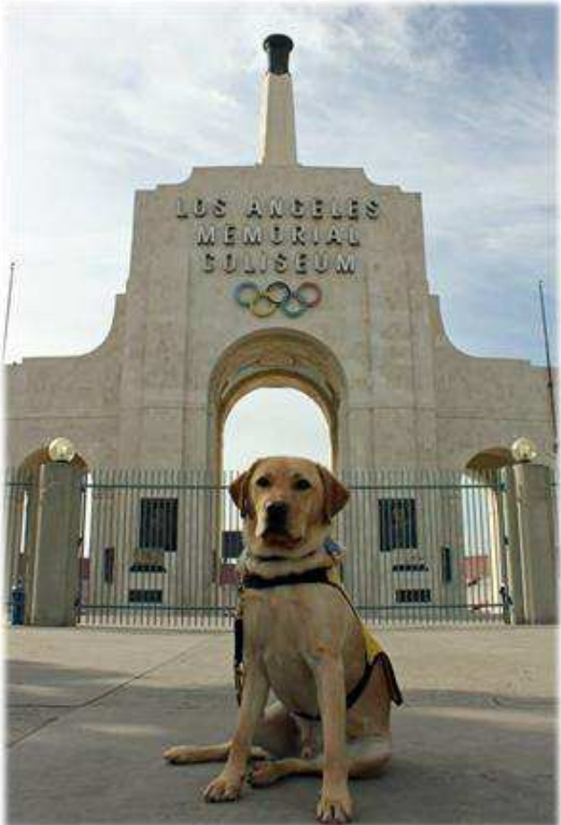
We took a walk over the the Coliseum after the RAMS rally.