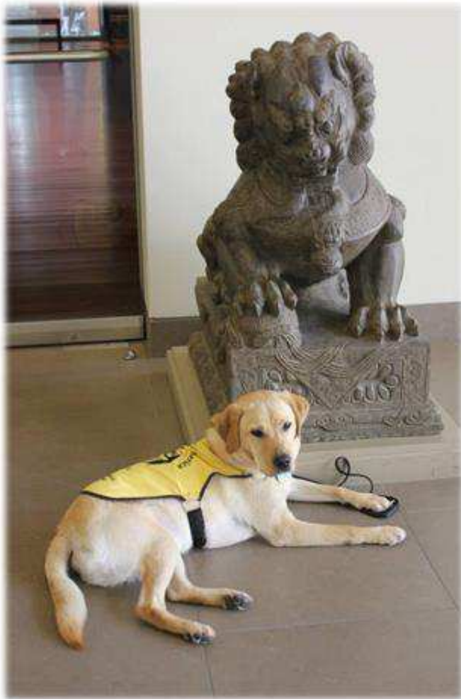
Foo dog sculpture. Wow, that is a crazy looking canine!