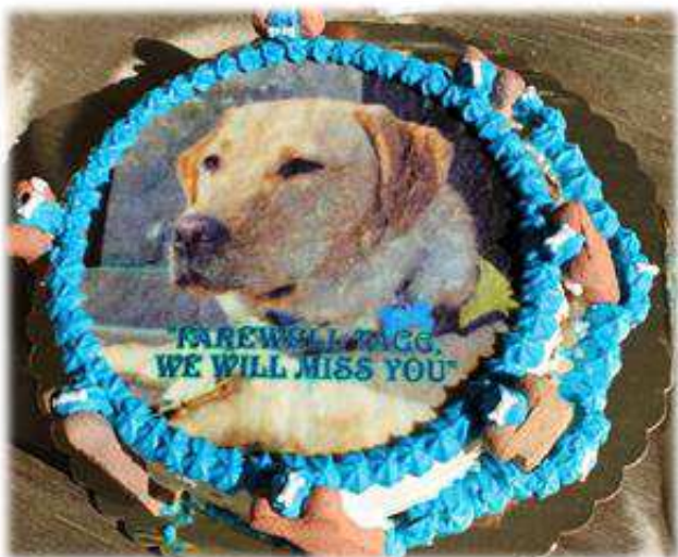
And a close up of the cake. It was delicious!