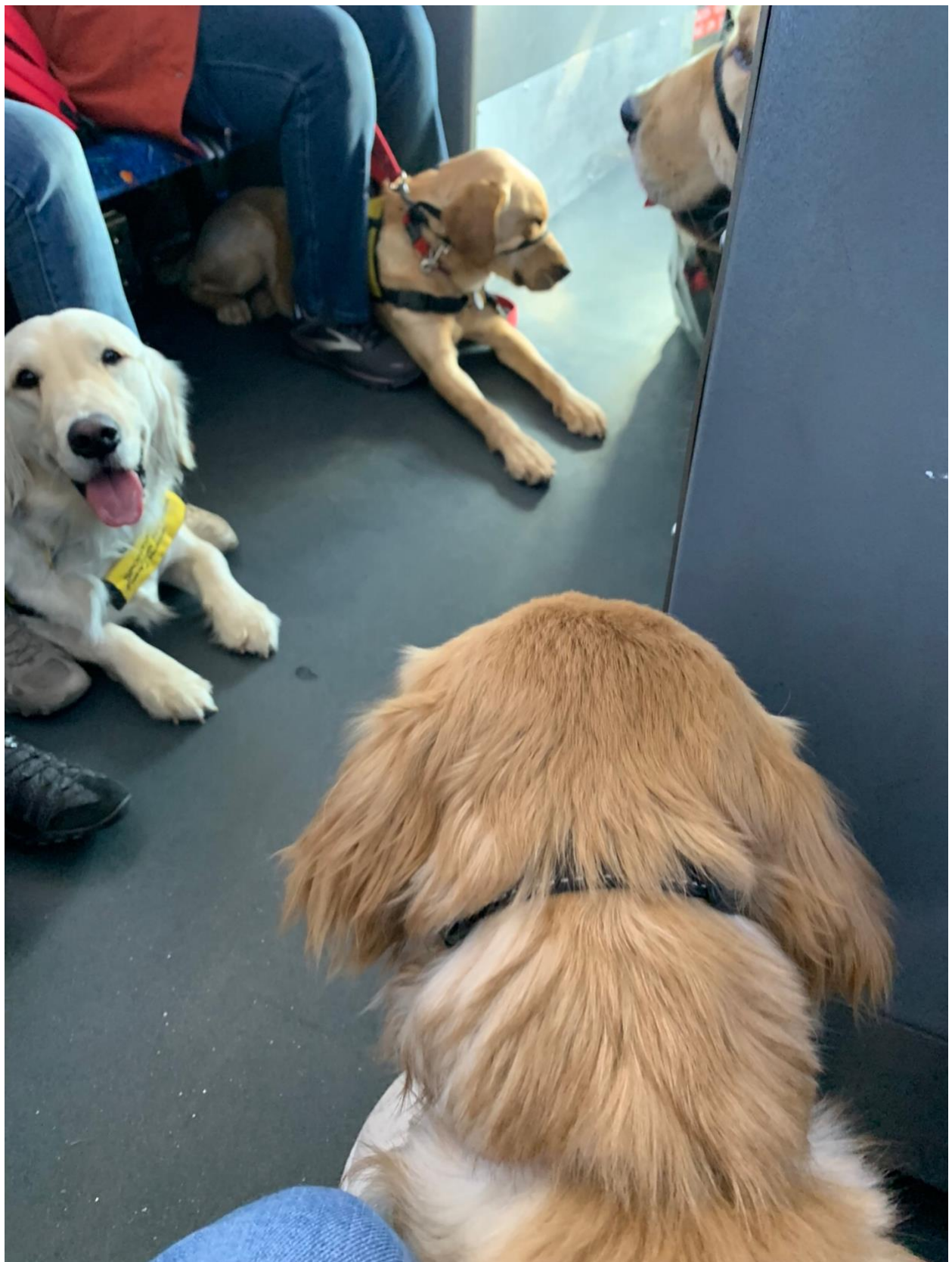
My friends on the bus.