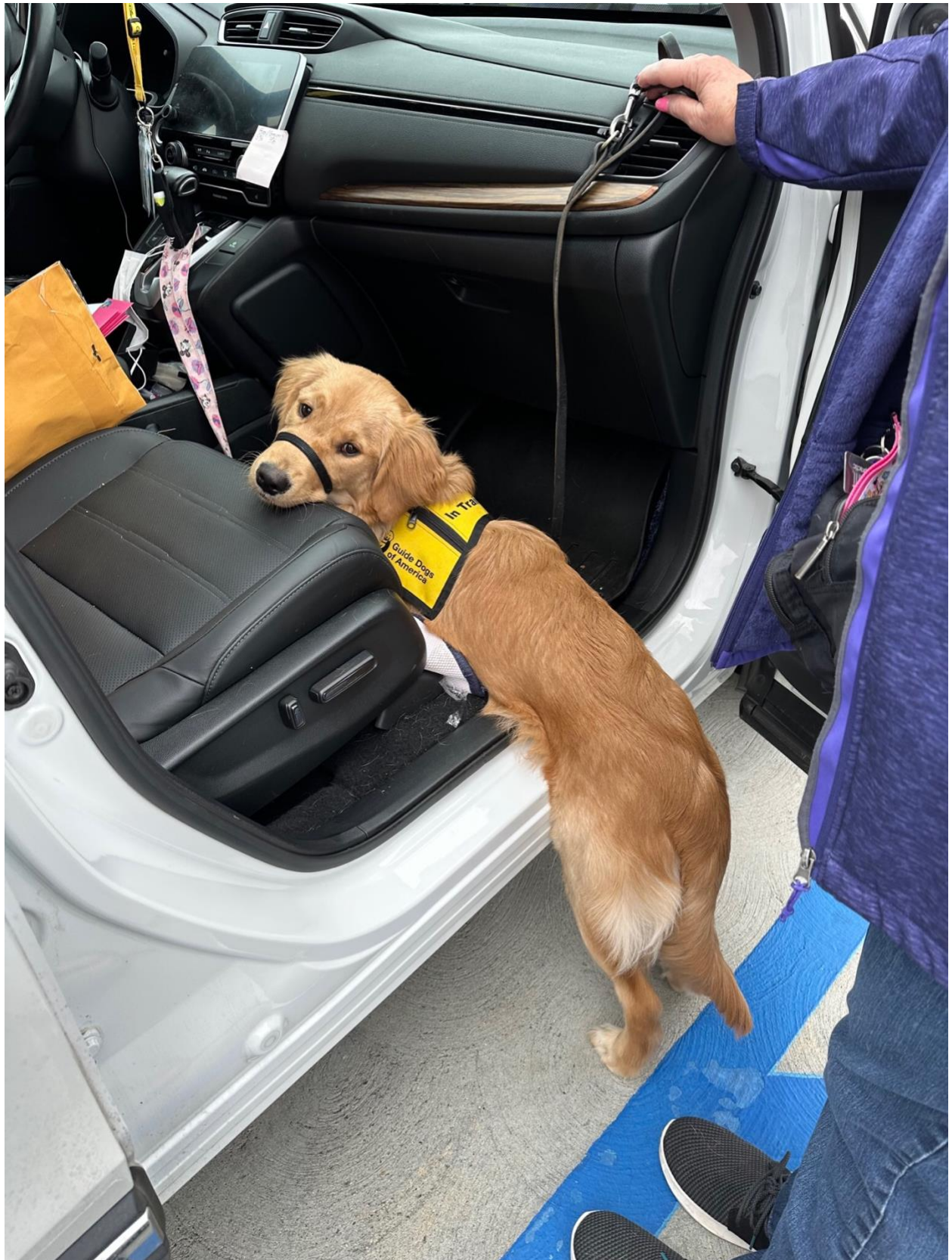
Getting in the car