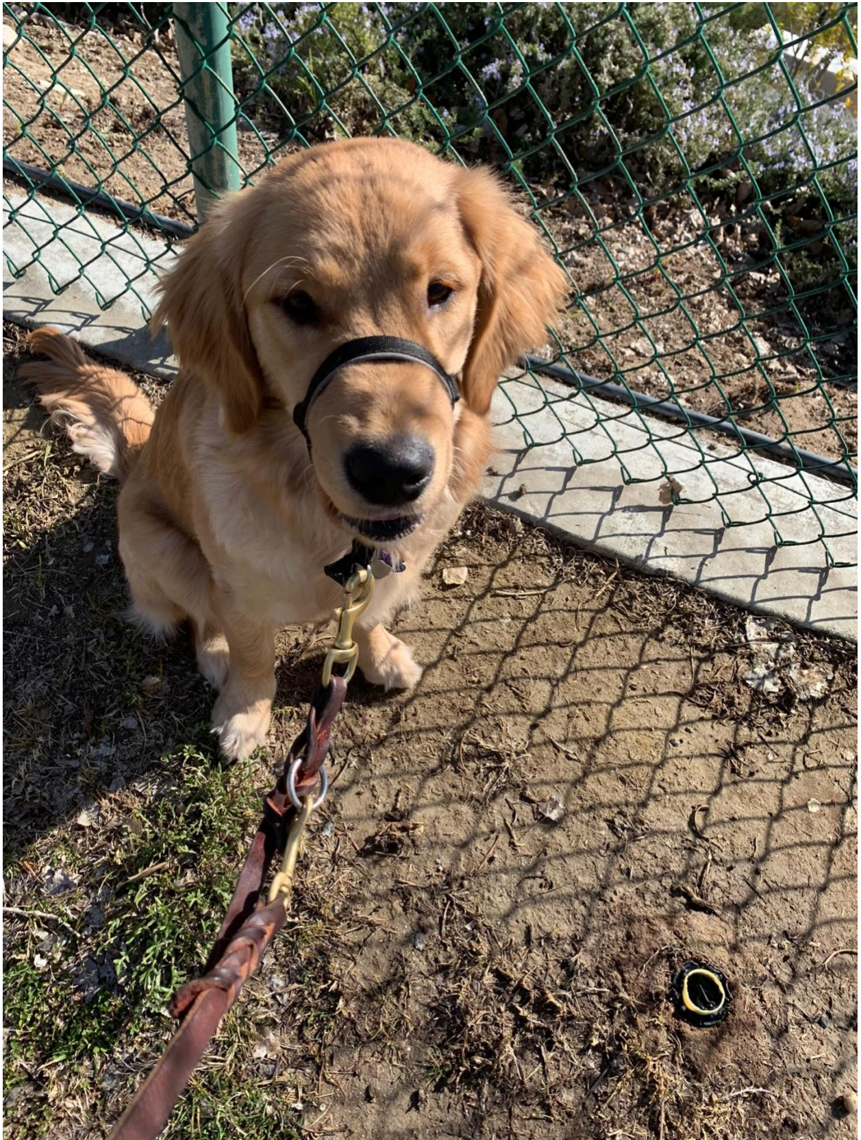
On a Friday, I went to Tesoro Park and we played in the rose garden.