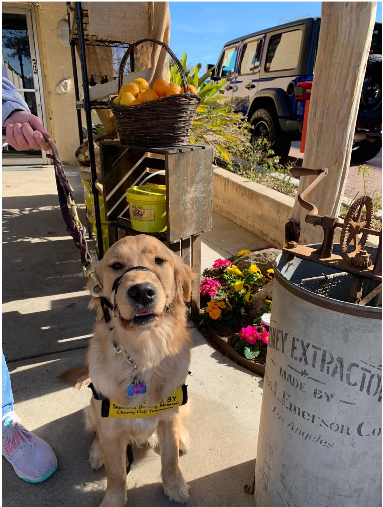
In front of the jail, now a honey shop.