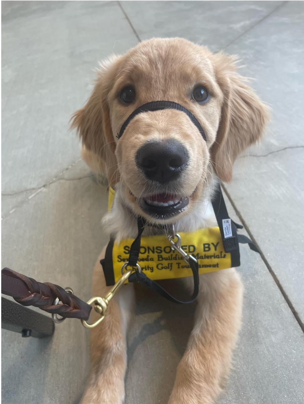
Here I am in my guide dog puppy jacket.