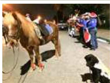
A HORSE !