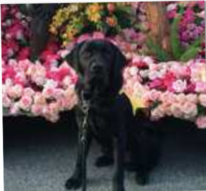
THE ROSE PARADE FLOATS !

me with environments that are increasingly more stimulating. In addition, they are having higher expectations of me in these environments. - all lots of fun! I hope you are well and enjoy my update. Wags & licks to my favorite sponsors!!!