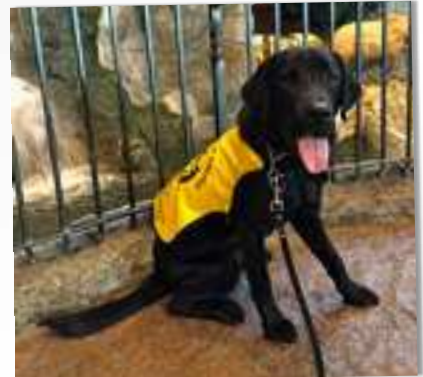
MAKING A SMILEY FACE!