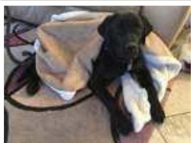
DOWN TIME :)