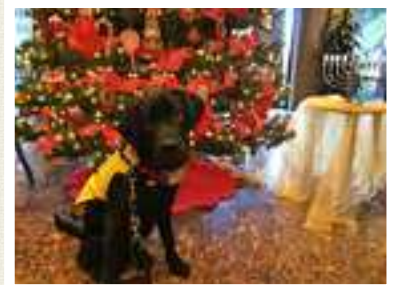
HAPPY HOLIDAYS !