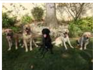
MY GDA FRIENDS

Time continues to just zoom by! I am growing into this super-handsome, very good boy who really loves people and getting out in the world. Since my last update, I took another obedience class in the community where I just rocked my sit-stays and down-stays. It was a really big class - we probably had 15 other puppies in the class, some were in the GDA program, other's not. It is very important that we take classes where we are exposed to non-GDA puppies as they just behave differently than we do.