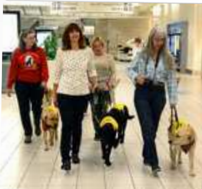
ONTARIO AIRPORT OUTING !