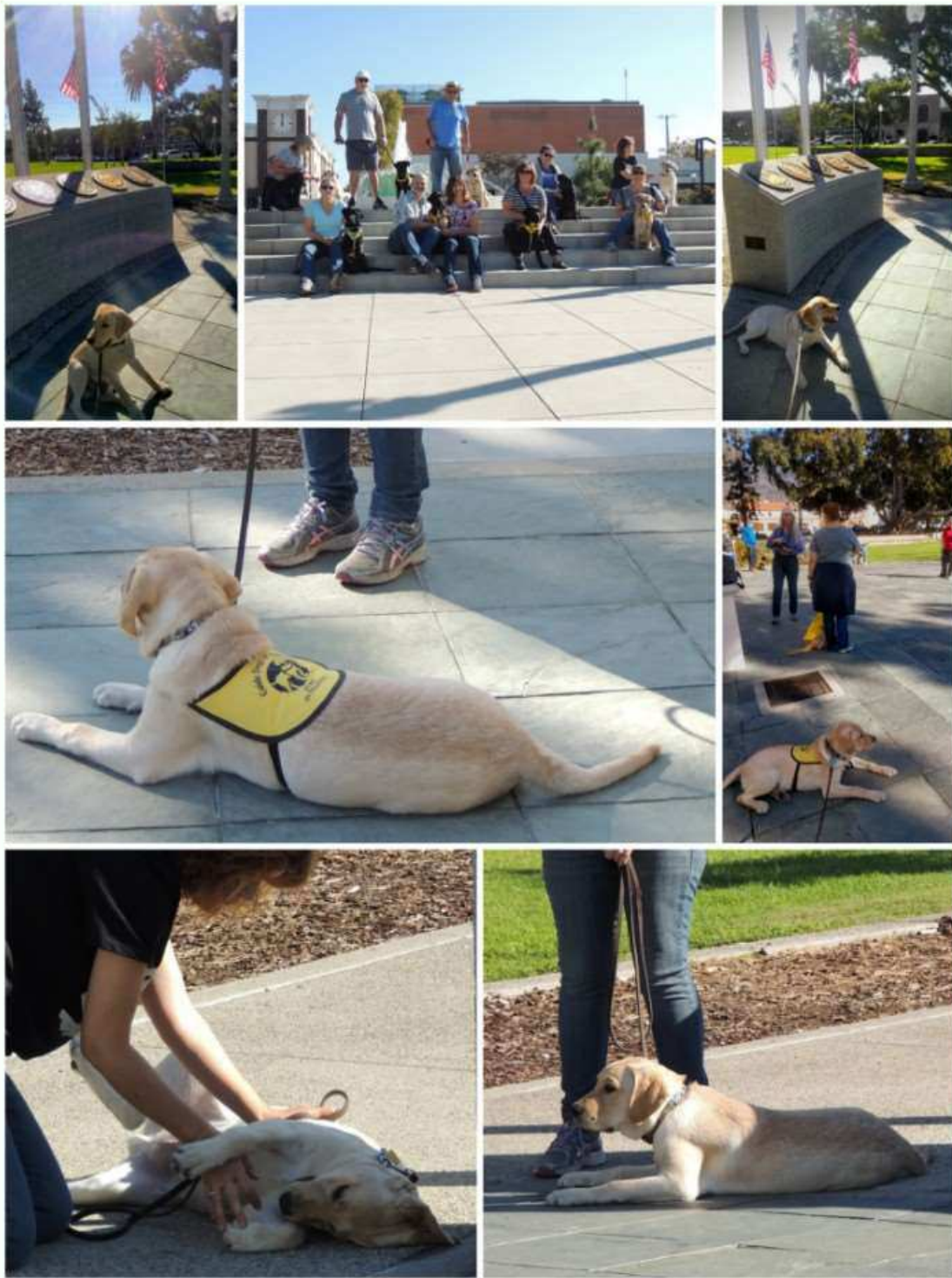
Practicing obedience in Monrovia Park