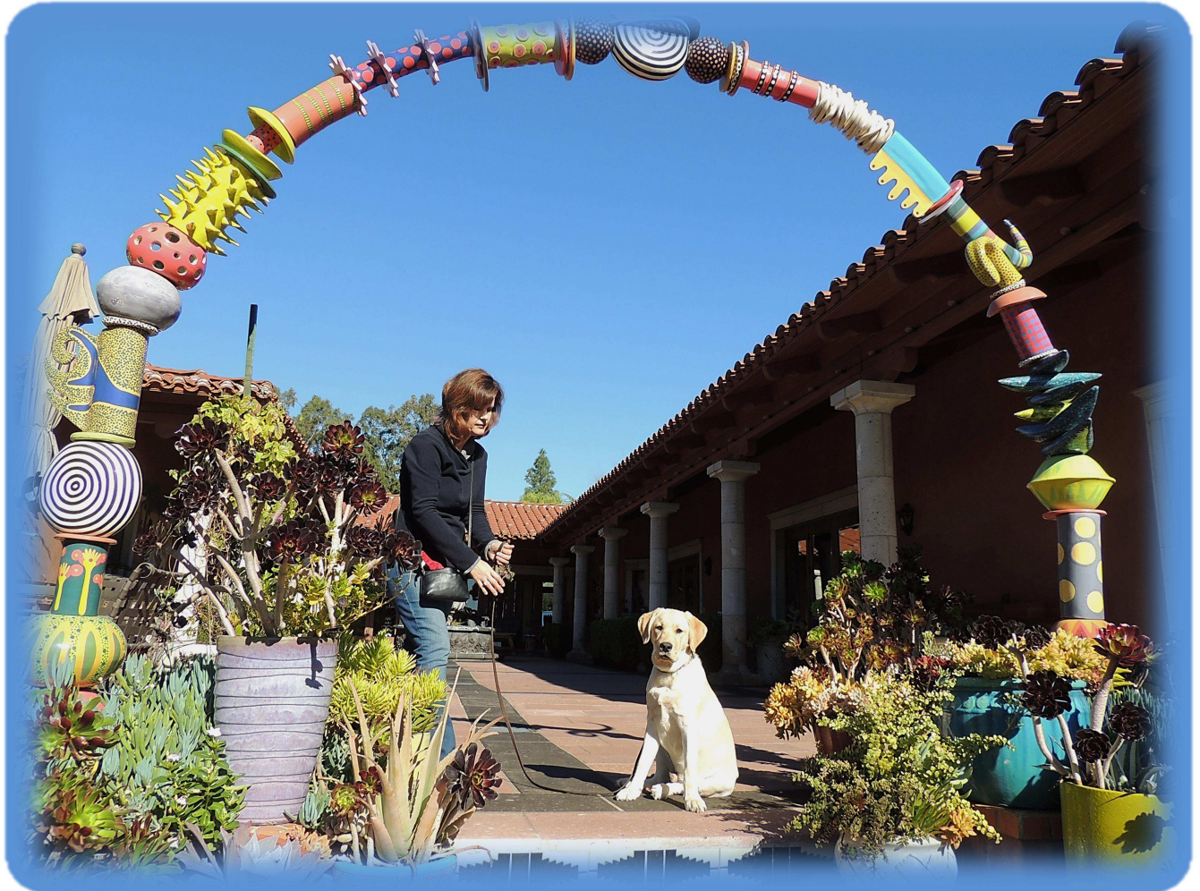
Augie in the Padua Hills at GDA's advanced puppy Kindergarten class.

Augie has grown and changed so much from mid-October to the middle of January. He has reached the end of his 6 th month by the conclusion of this update. Augie has graduated from puppy kindergarten & is concluding advanced puppy obedience classes. The advanced classes are taught by Guide Dogs of America out in public settings in various communities. Thanks to his sponsor Augie gets to take advantage of all of these wonderful programs to help him reach the goal of becoming a guide dog. He has learned all of his basic commands and is a happy willing worker.